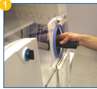
Roll a replacement membrane and insert into the workstation through the membrane that is not being replaced.

One of the patented features of this system is that a membrane can be changed without compromising workstation environmental conditions.