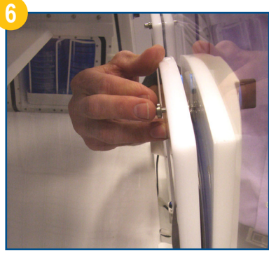
Raise the membrane carrier back into position. Tighten the screw until the carrier is firmly in place.

Check that the membrane provides a gas tight seal between the carrier and the inside face of the chamber.