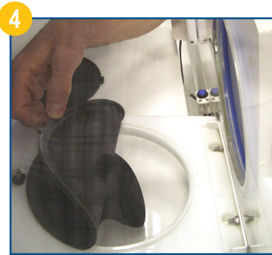
Carefully peel the existing membrane out of the retaining slot in the membrane carrier.