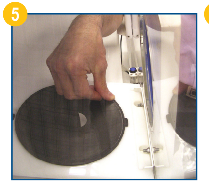
Position the replacement membrane into the retaining slot, carefully pressing the membrane into place along it's entire edge. Take special care that the location tab engages with the small pocket at the lower edge of the carrier.